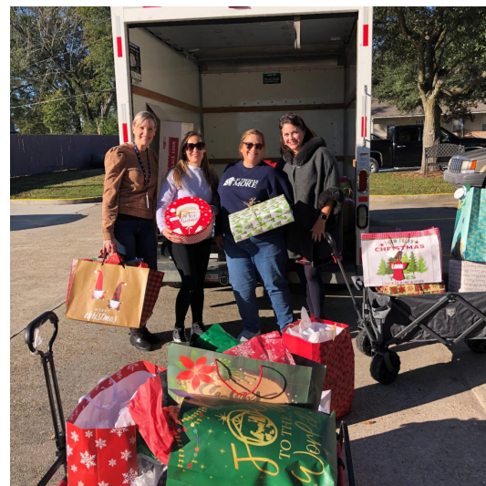
Thank you St. Thomas More Catholic Church for supporting our seniors!