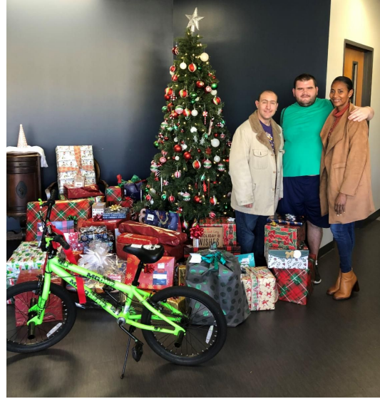
Our Day Center participants loved helping out!