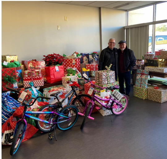
St. Margaret's Episcopal Church went above & beyond!

went above and beyond to make sure Christmas was merry and bright for those we serve! Hope Under the Tree received more than 775 gifts , which amounted to more than $30,000 in in-kind donations. Because of YOU, more than 475 individuals, children, and families received special gifts under their Christmas tree that they would not have had otherwise. Our heartfelt gratitude goes out to all who made it possible!